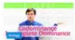
Codominance - Incomp... 381,227 views