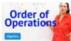
Order of Operations ... 215,871 views