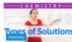
Types of Solutions 288,390 views