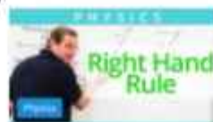
Right hand Rule 124,420 views

High school scholars can use this site for reference, rather an interactive reference website, which will mitigate their learning problems.